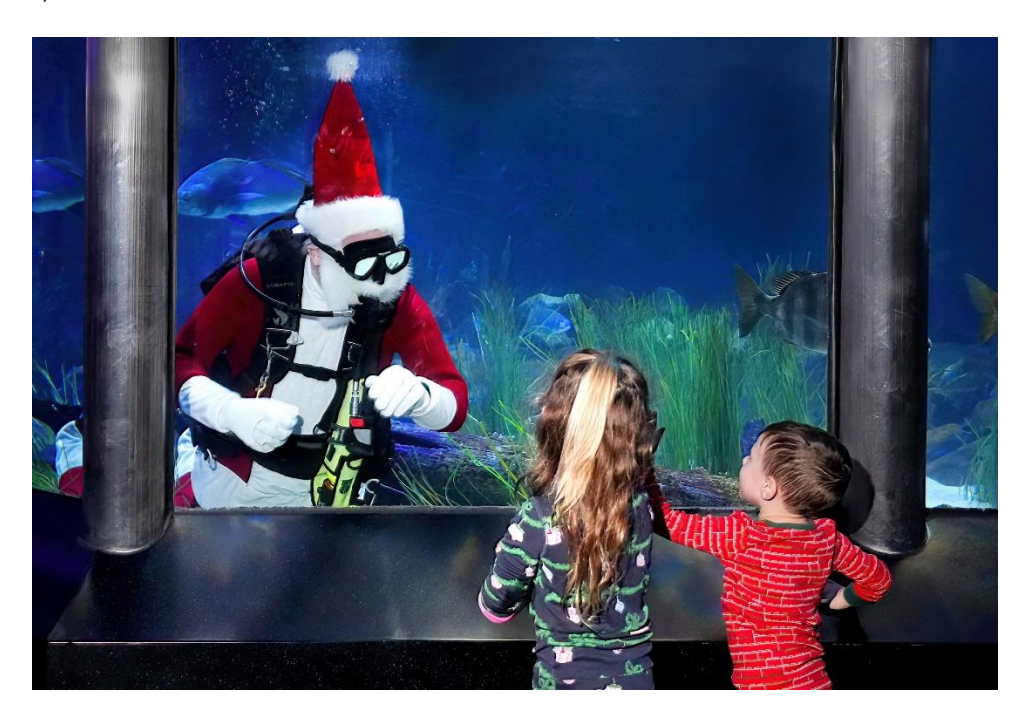
Celebrate the "Holi-Rays" at the Virginia Aquarium for Two Nights in December

Virginia Beach, VA - The Virginia Aquarium & Marine Science Center is decking the halls and exhibits, transforming into a winter wonderland with twinkling lights, doorway singers, and holiday cheer! Jingle all the way to "Holi-Rays" on December 13 and 14 from 6 to 9 p.m. This holiday event is presented by PRA Group.